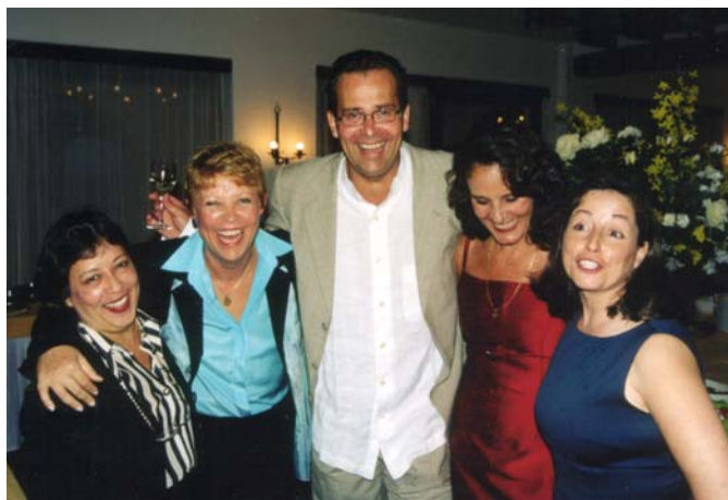
As we can see our Director was able to celebrate adequately the achievements of the Conference, with other Directors from Brazil and USA. ....